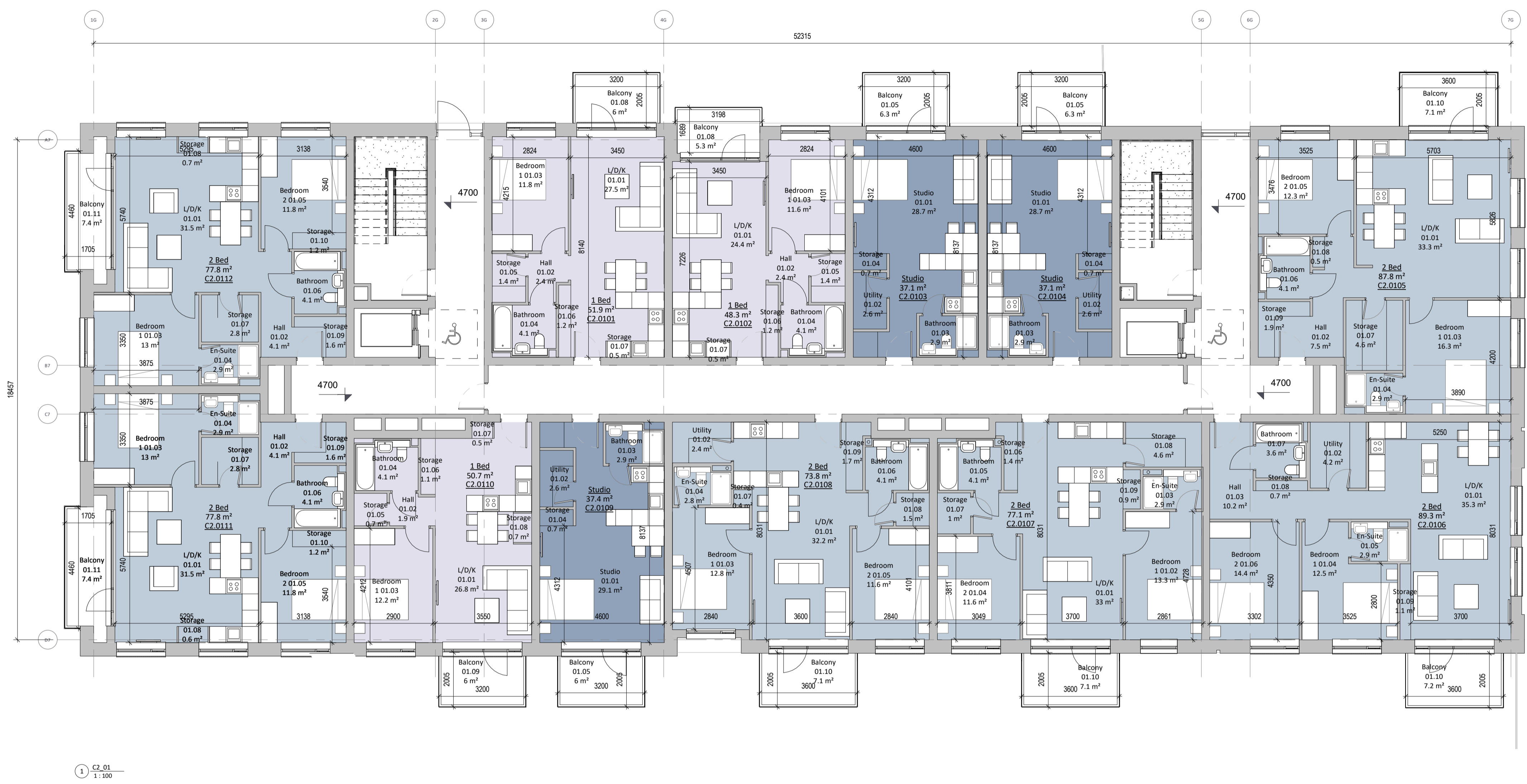
1 C2_01 1:100